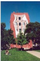
View of mural on west elevation – July 2001