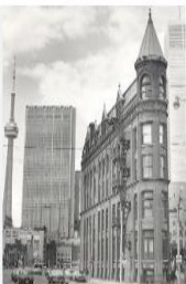
View of south façade – August 1977