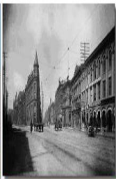
Historic view of the building – c. 1895